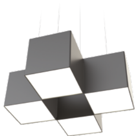
dark gray matt